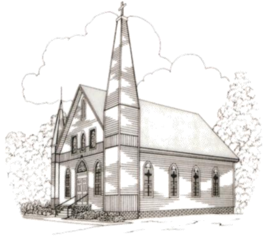
New Hope United Methodist Church Established 1795 Pomaria, South Carolina