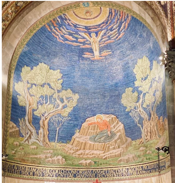
Apse of the Church of All Nations/ Church of the Agony Gethsemane, Jerusalem.

Our Father, who art in heaven, hallowed be thy name, thy kingdom come, thy will be done, on earth as it is in heaven. Give us this day our daily bread; and forgive us our trespasses, as we forgive those who trespass against us; and lead us not into temptation, but deliver us from evil. For thine is the kingdom, and the power, and the glory, forever and ever. Amen.