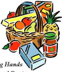
Helping Hands Food Pantry

The best way to find yourself, is to lose yourself in the service of others.