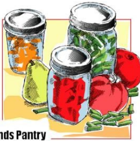
Helping Hands Pantry