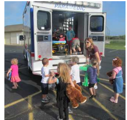
CDO children take Warm Fuzzies onto the EMSA ambulance March 29.