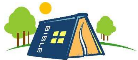
Camp sessions aren't that far in the future!