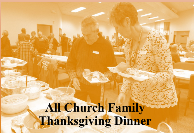
All Church Family Thanksgiving Dinner

Let us continue to pray for all those affected by this pandemic and that the Lord will bring it to a swift end soon so that we can once more enjoy our fellowship together in Christ.