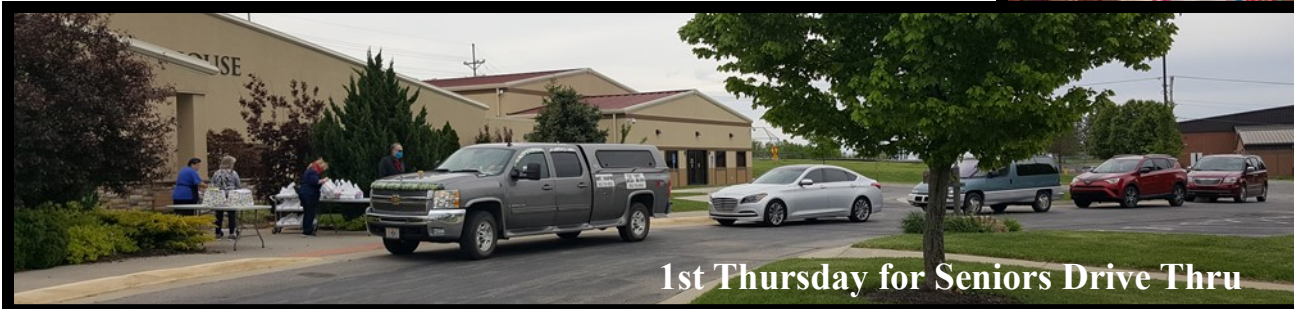
1st Thursday for Seniors Drive Thru

Do not be anxious about anything, but in every situation, by prayer and petition, with thanksgiving, present your request to God. And the peace of God, which transcends all understanding, will guard your hearts and your minds in Christ Jesus.