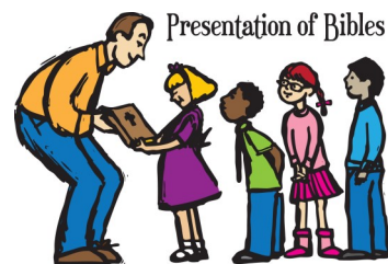
Presentation of Bibles