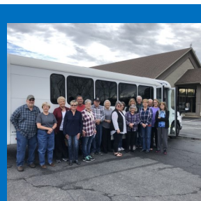
Senior Adult Fellowships