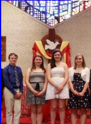
Members of 2013 Confirmation Class