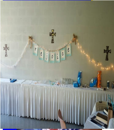
Women's Retreat 2015

In October, the women and friends of Parkwood gathered at Antiochian Village in Ligonier for a time of rest and renewal at the Annual Women's Retreat.