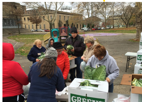
Parkwood assisting in distributing 2 tons of food during Produce to People in November