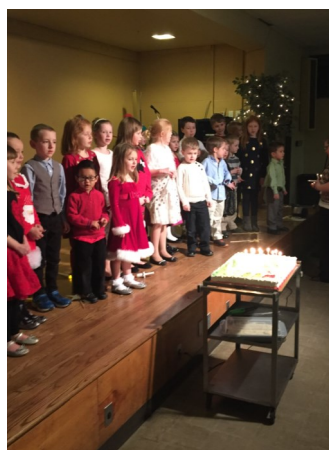
Children singing Happy Birthday to Jesus