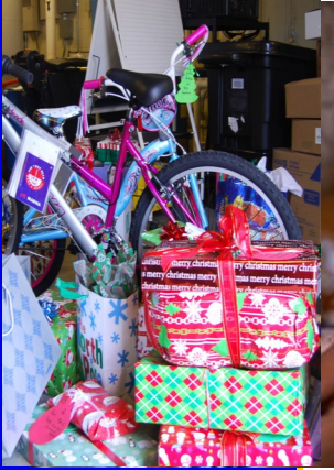
Gifts being delivered to HEARTH HOME

Thank you for your generous donations for the Angel Tree this year. This program run by the Deacons has been a mainstay in the ministry of Parkwood Church for many years. Because of your generosity, we were able to help over 50 people. Those do-