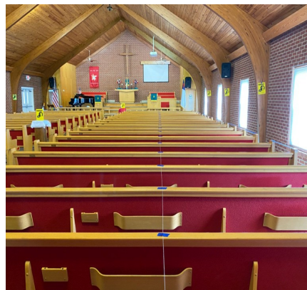
Pews are Divided and half to keep social distancing