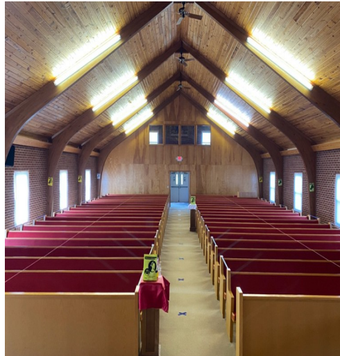
Full view of Sanctuary