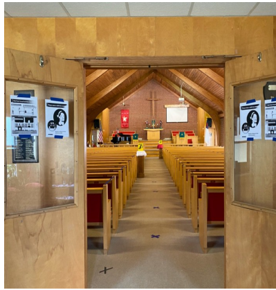
View when entering the Narthex