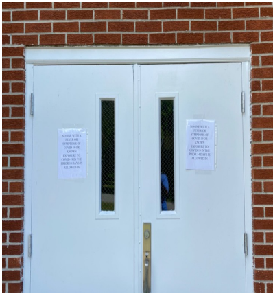
Sings on Front Doors