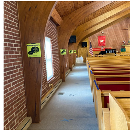
Left Side of Sanctuary