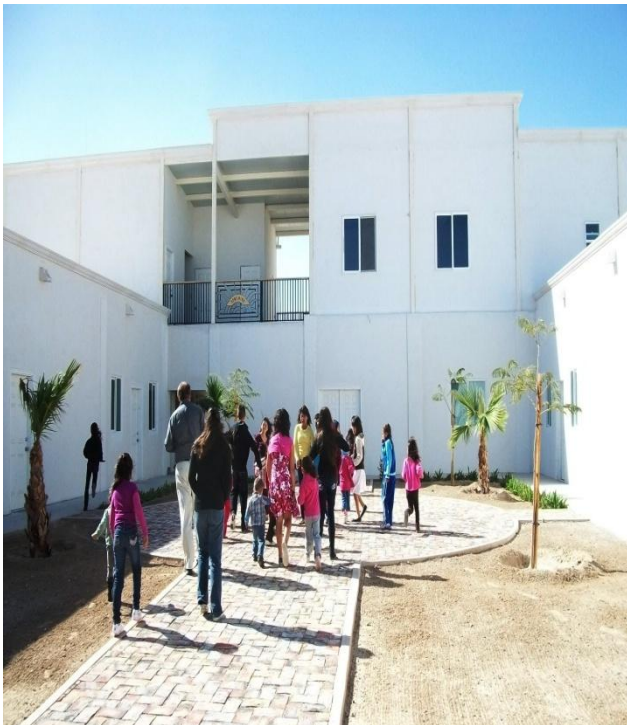
A few visitors took a tour of Sonshine recently