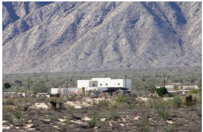
A view from afar of Sunshine Hacienda