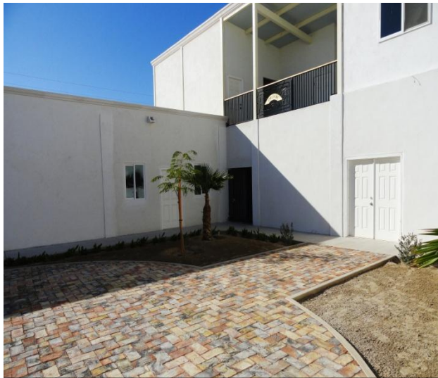
Courtyard to Sonshine Hacienda