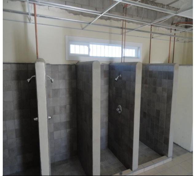
The show stalls in one of the Dorm bathrooms