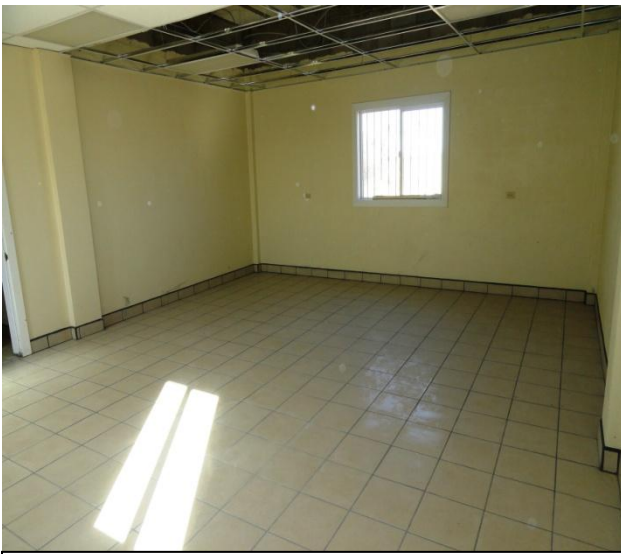
Dorm Room 1 of 4