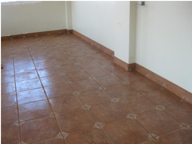
Dining Room /Great room