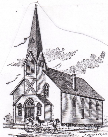
Located at Sixth and Court Streets where the Public Library now stands.

In the 1960's our church sponsored deserving students as our "summer assistants". These young people took charge of very active MYF groups. Yes, they met all summer. The summer assistants also visited the hospital and in homes.