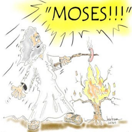
Sometimes God speaks to us when we least expect it!

http://www.bing.com/images/search?q=Christian+Cartoons+for+Newsletters&FORM=RESTAB#view=detail&id=0D4184DE0A239A9BD1D0C94AB A7DF4C013F1F43D&selectedIndex=21