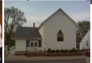
Fellowship Baptist Church, Shelbyville, IL

Food Pantry- We believe that the Bible says to care for those who are hungry (Matt 25:35-36). If you are in need, or know someone