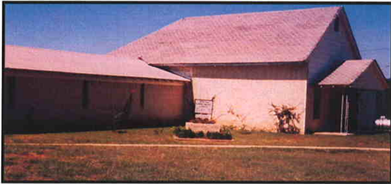
Elwood Baptist Church Late 1970's