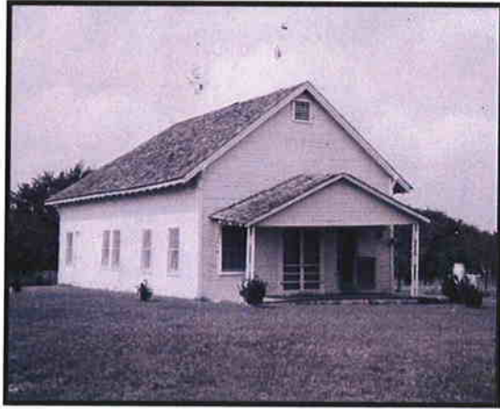
Elwood Baptist Church as it looked in the mid 1960's