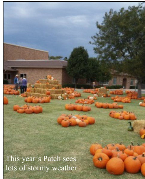
This year's Patch sees lots of stormy weather.