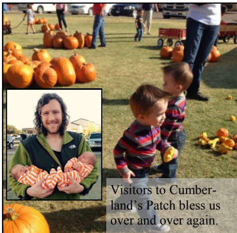
Visitors to Cumberland's Patch bless us over and over again.