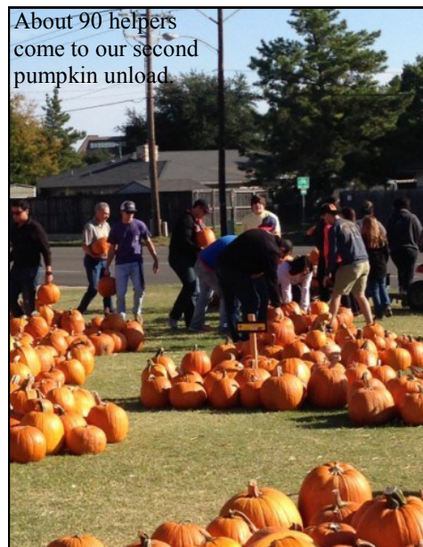
About 90 helpers come to our second pumpkin unload.