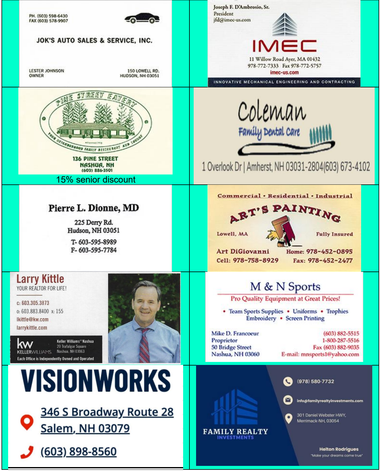
Please use them when you can. They support us and they deserve our support.