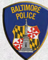
BALTIMORE CITY POLICE

A message from the Maryland Transit Administration