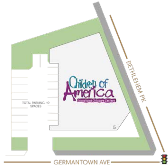
8625 GERMANTOWN AVE