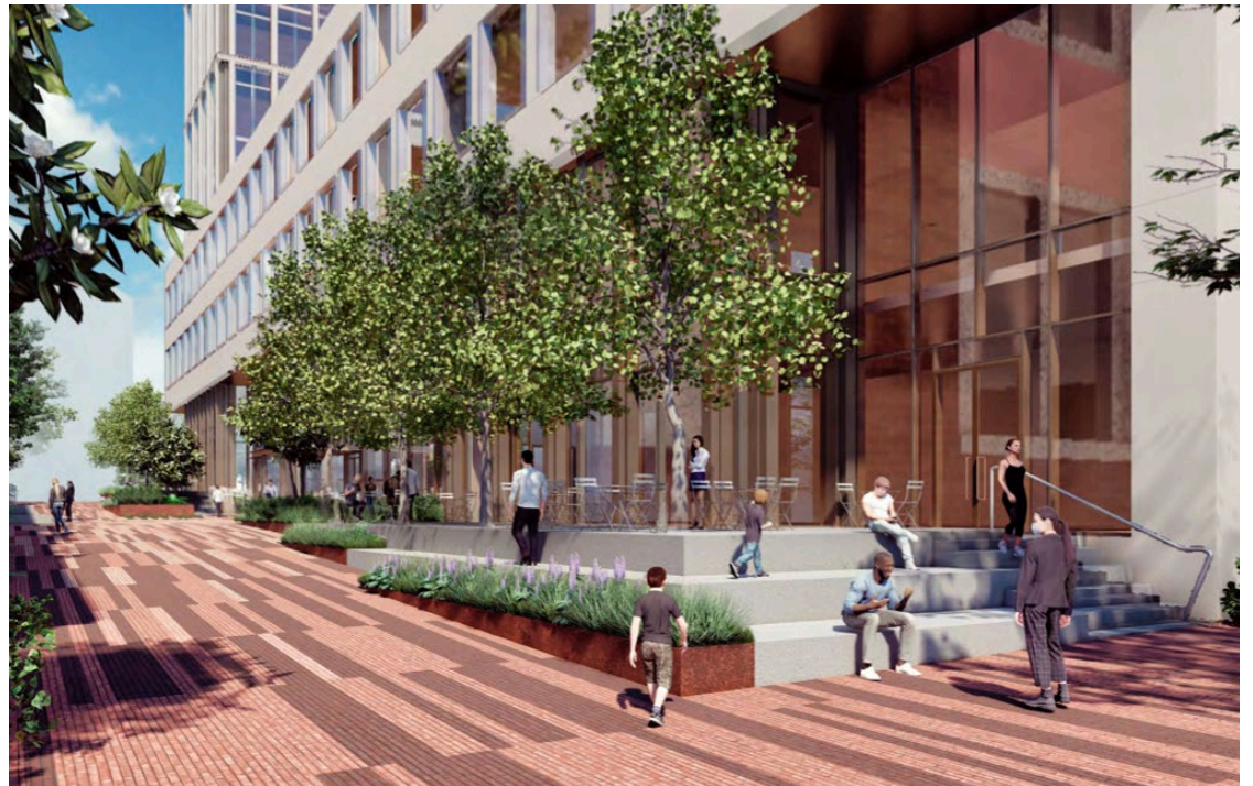
CUTHBERT STREET LOOKING EAST FROM 33RD