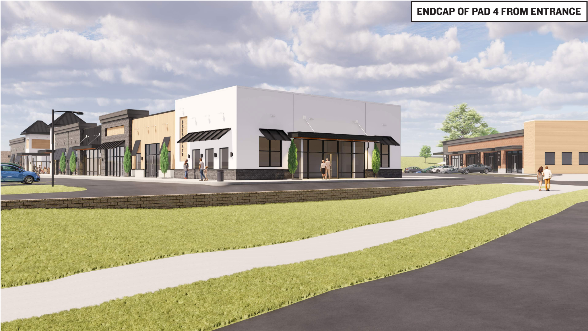
ENDCAP OF PAD 4 FROM ENTRANCE