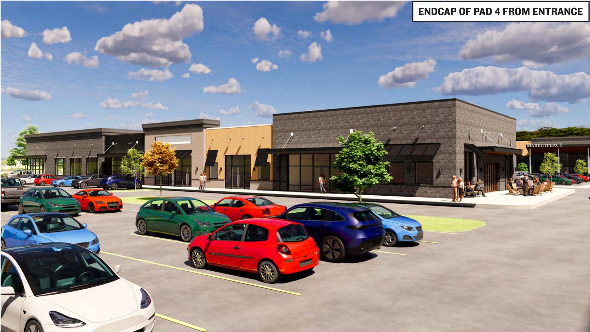
ENDCAP OF PAD 4 FROM ENTRANCE