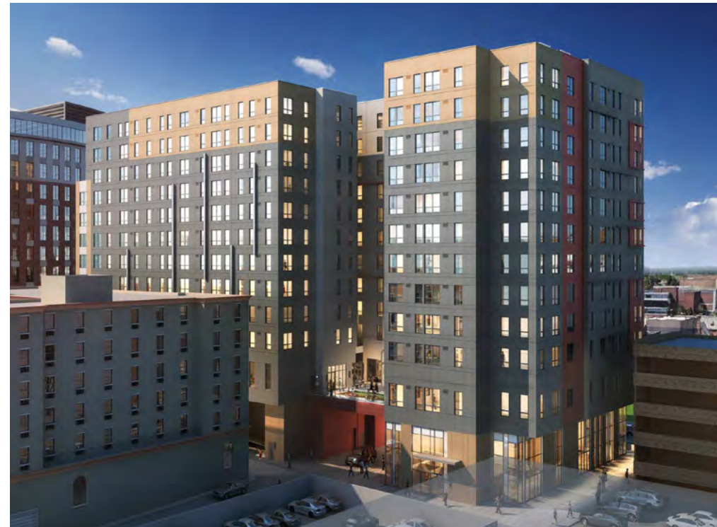
View from Calder Way