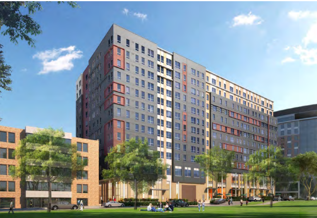
View from College Avenue

MATTHEW COOPER mcooper@hellomsc.com 833.FOR.MSCU