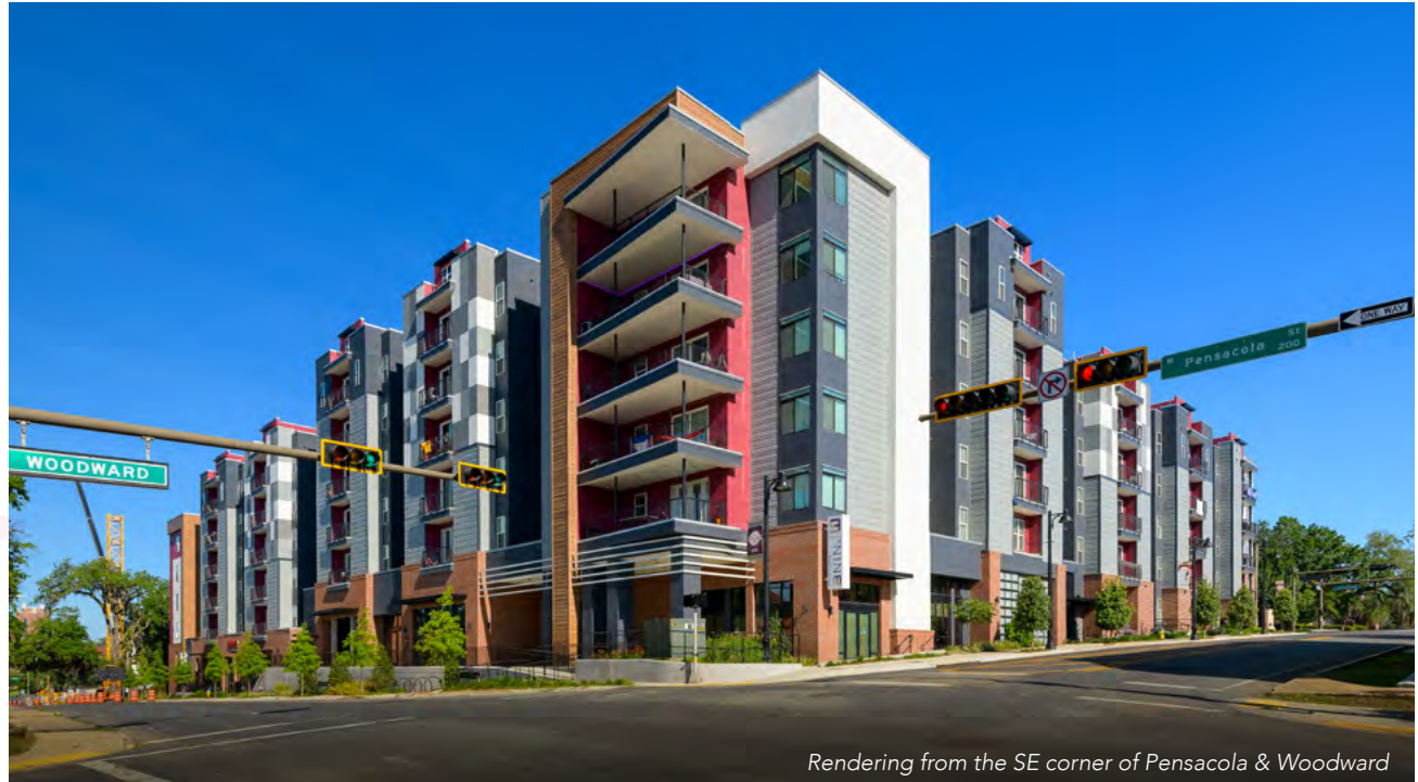
Rendering from the SE corner of Pensacola & Woodward