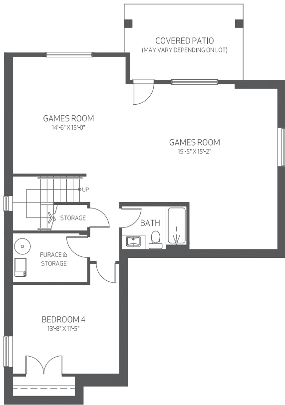
Lower 1,156 SF

Showing optional finished basement. Walkout, windows and doors may vary.