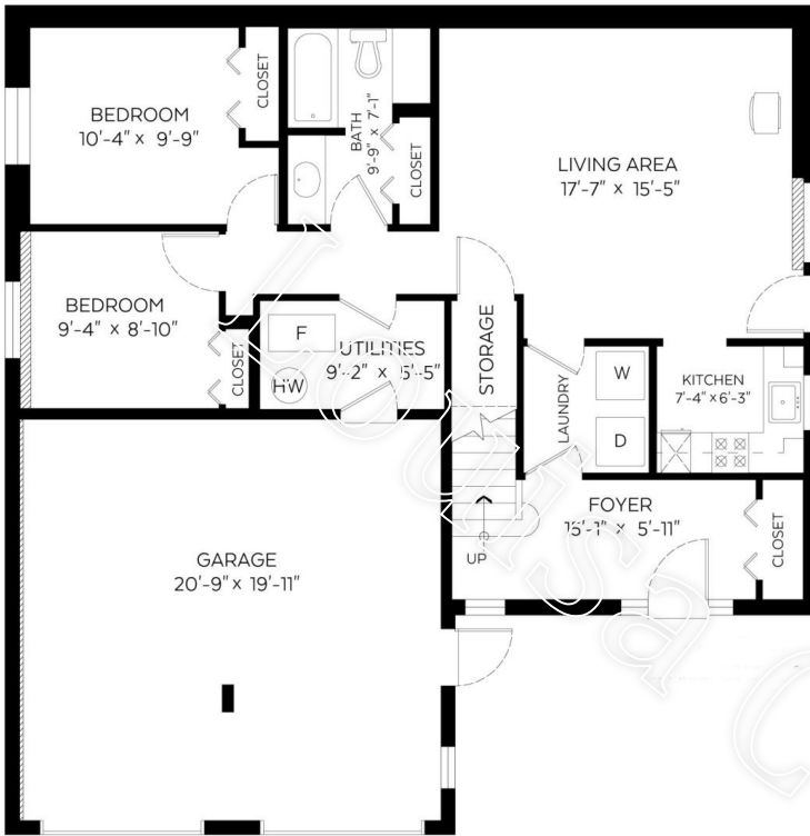
Lower Floor – 1,013 Sqft