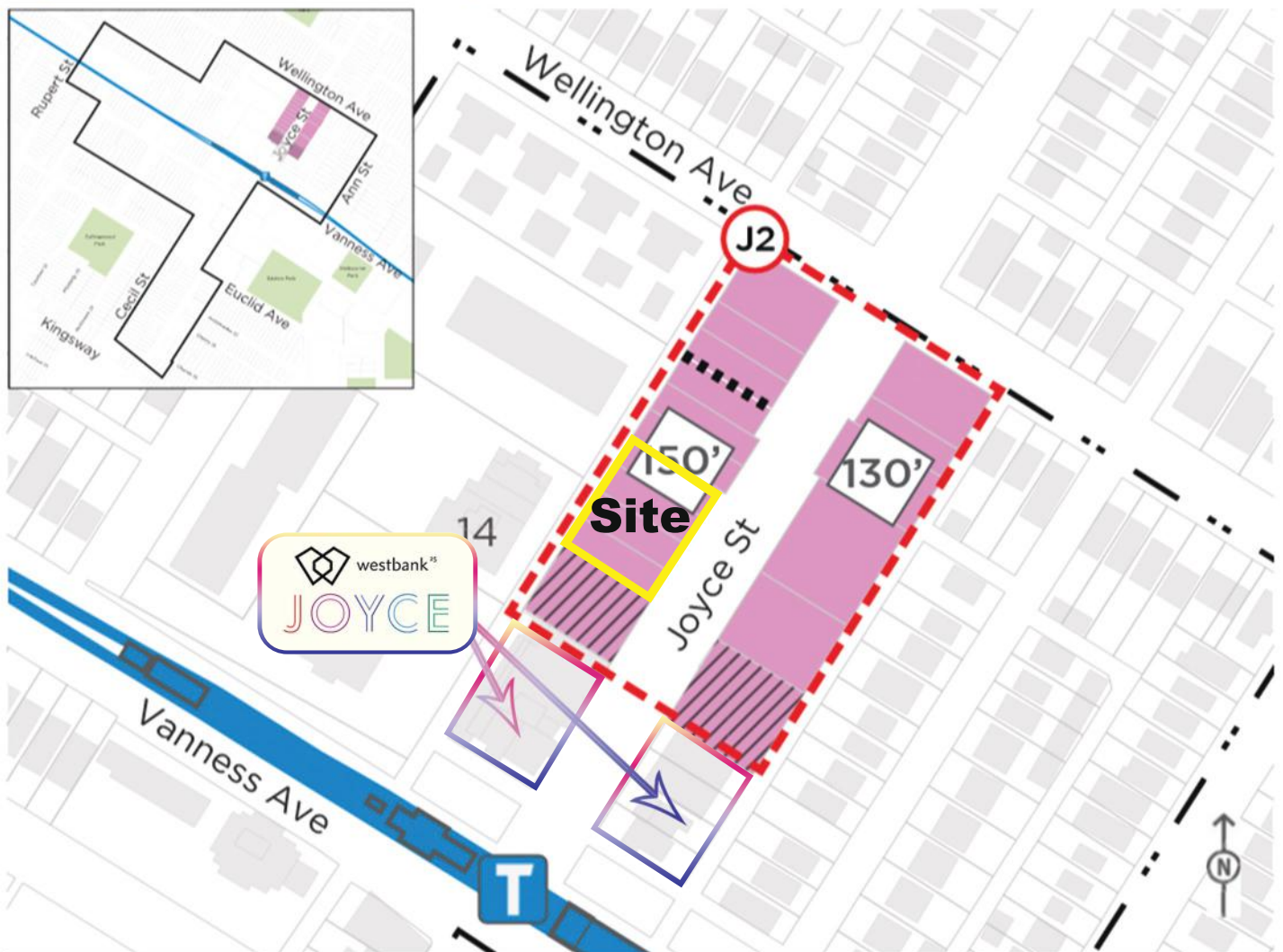
Figure 5.3: Sub-Area J2 - Joyce Street North of the Station