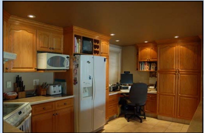
Family style light oak kitchen with extra counter and cupboard space.