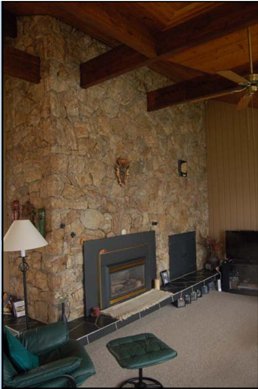
Formal living room with vaulted ceiling and a massive stone fireplace.