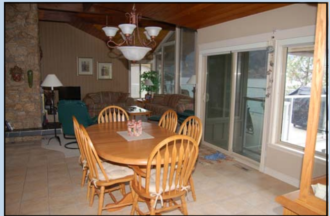
Dining area with sliders onto sundeck leads off...