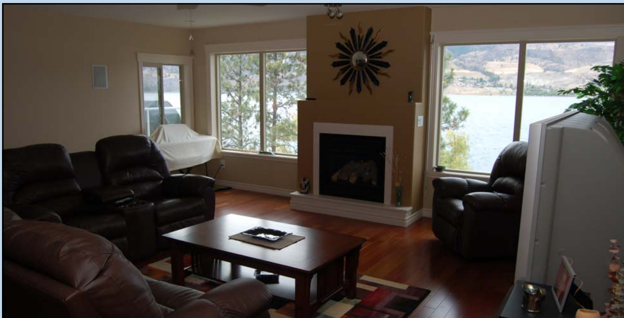
..... to a central family room with a wall of glass and a warm gas fireplace.