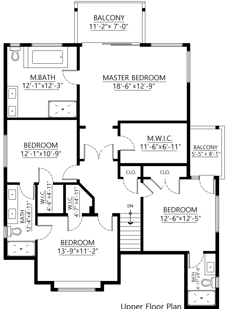
Upper Floor Plan Floor Area: 1,354 sq.ft.