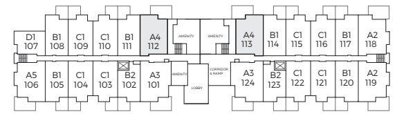
LEVEL 1 - BUILDING B