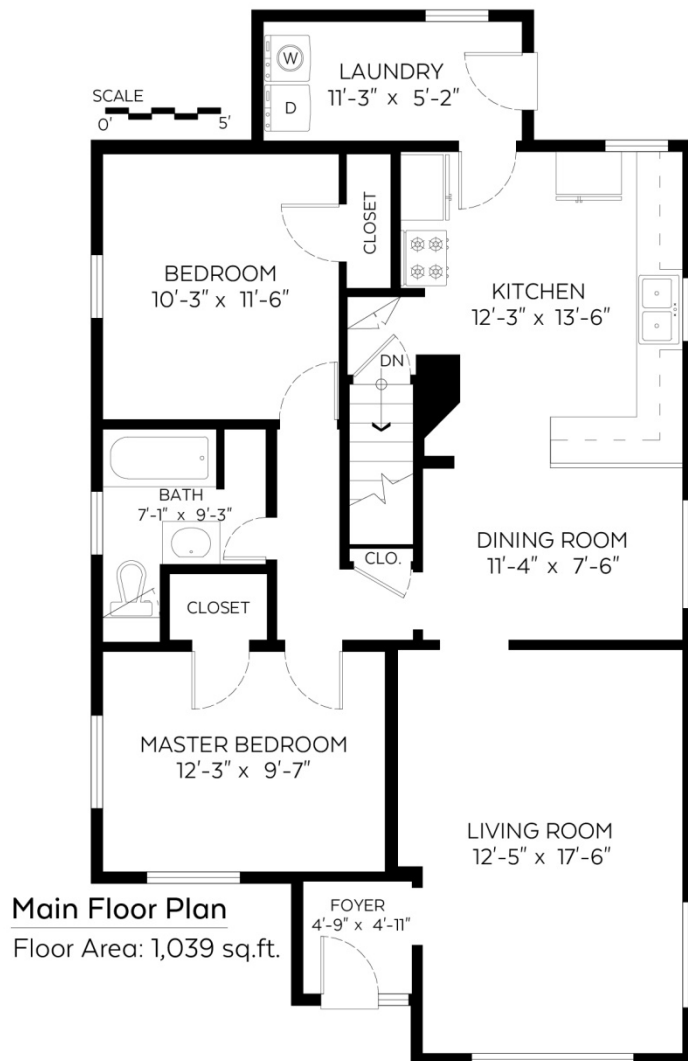
Main Floor Plan Floor Area: 1,039 sq.ft.