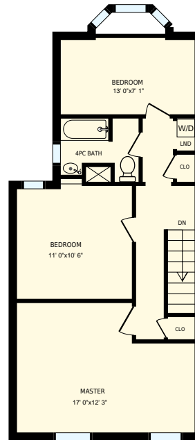
2nd Floor Exterior Area 672 sq. ft.