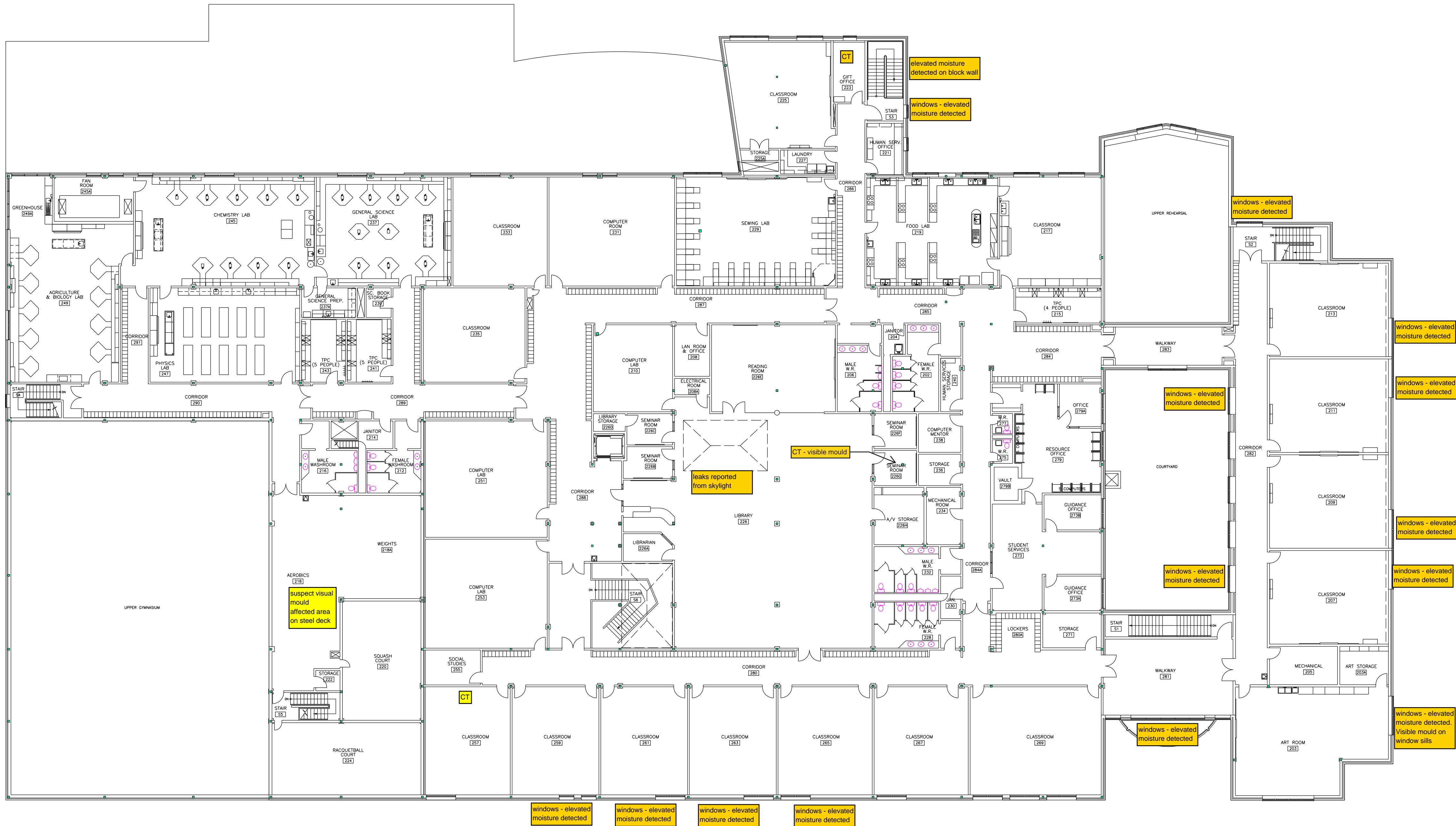
SECOND FLOOR PLAN SCALE = 1:200