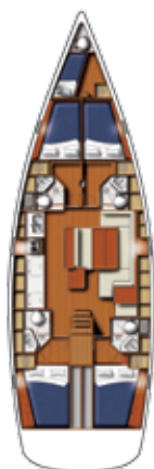
CLASS A Moorings 50.5

The Moorings continues to invest in our fleet to provide the highest quality yachts, and are pleased to offer an excellent range of Beneteau-built yachts across all 3 regatta classes. Each yacht is custom-designed for easy handling and maximum performance – ready to sail when you arrive!