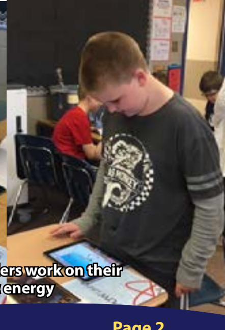
Waverly 4th graders work on their studies of kinetic energy