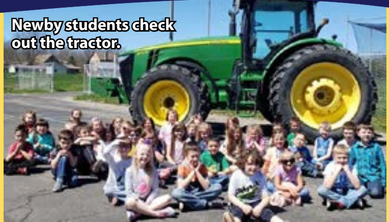
Newby students check out the tractor.