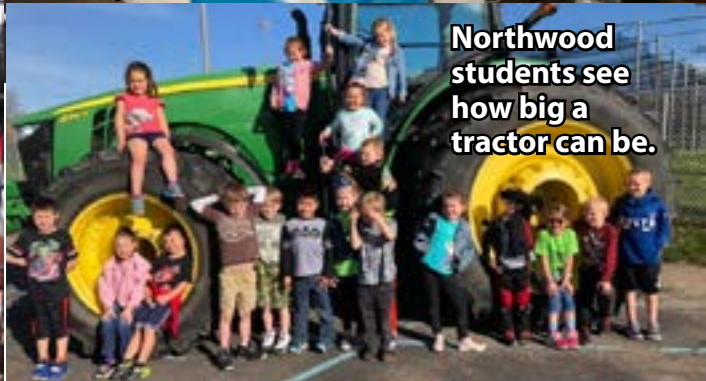
Northwood students see how big a tractor can be.