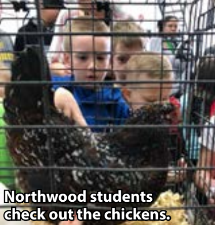
Northwood students check out the chickens.