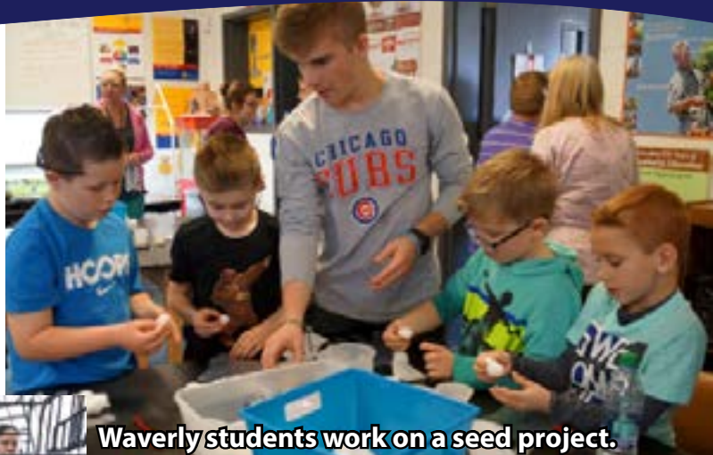
Waverly students work on a seed project.