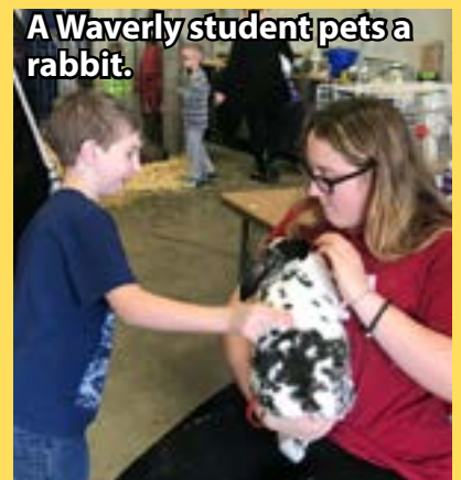
A Waverly student pets a rabbit.

The trip provided the young students many hands-on activities with plants, animals, and even a tractor. See more photos, p. 4