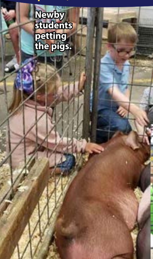
Newby students petting the pigs.