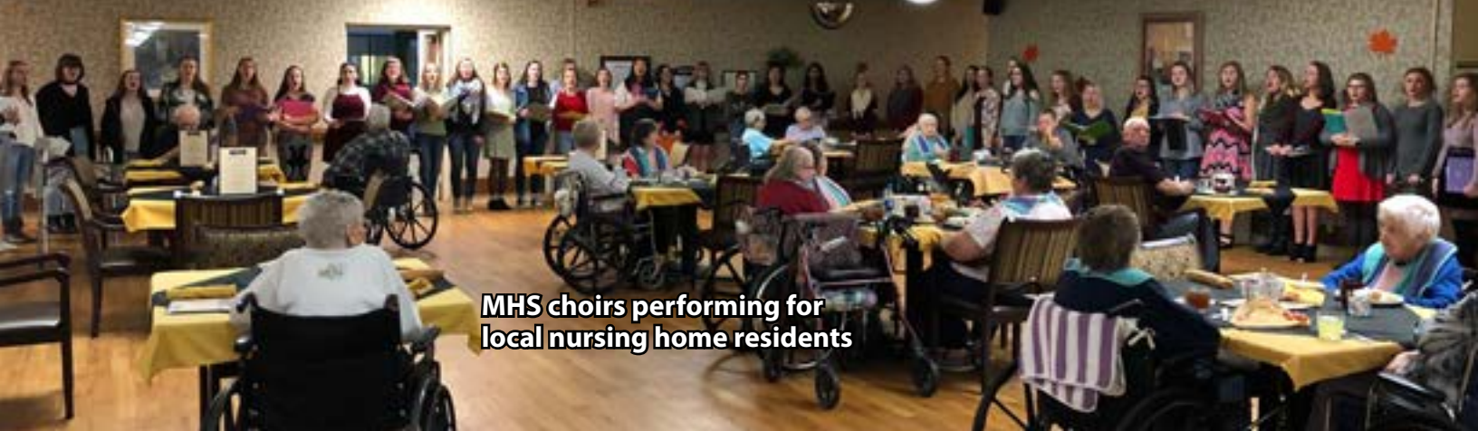
MHS choirs performing for local nursing home residents