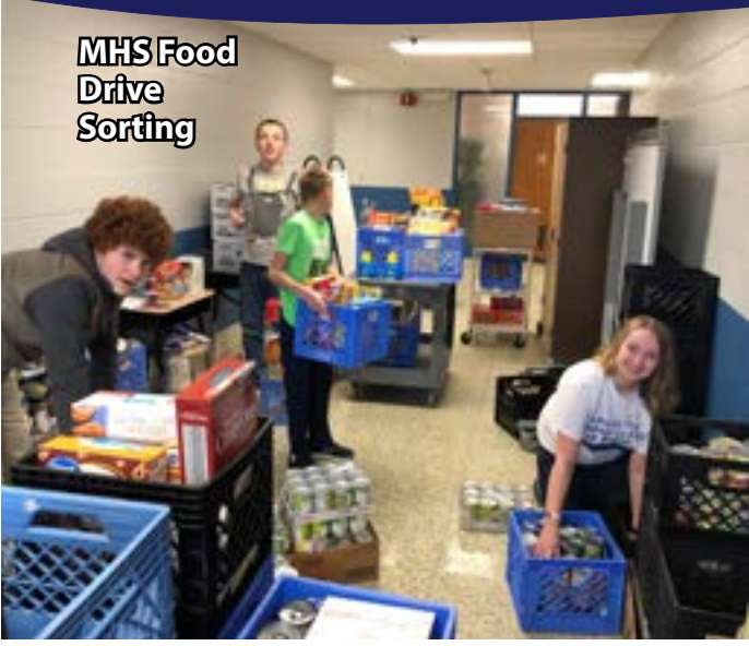
MHS Food Drive Sorting