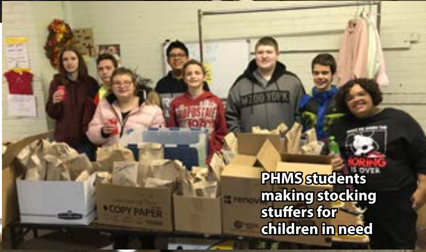
PHMS students making stocking stuffers for children in need

Student groups around the district have taken part in several projects to bring smiles to others recently.