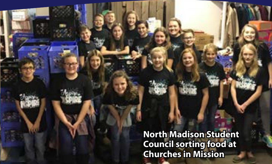
North Madison Student Council sorting food at Churches in Mission