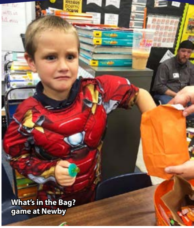
What's in the Bag? game at Newby