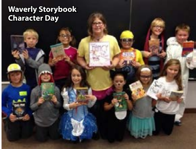
Waverly Storybook Character Day