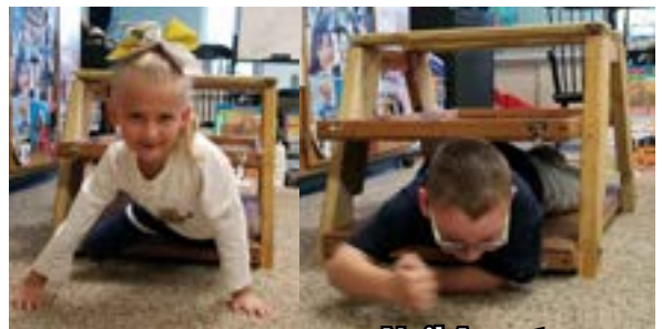
Neil Armstrong second grade