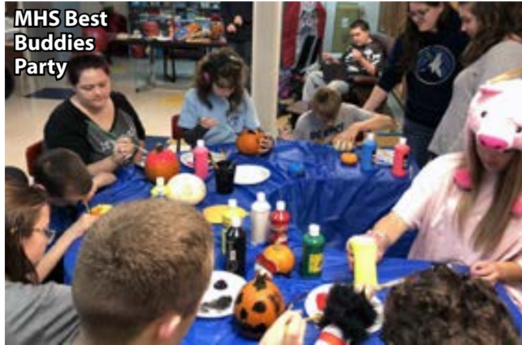
MHS Best Buddies Party