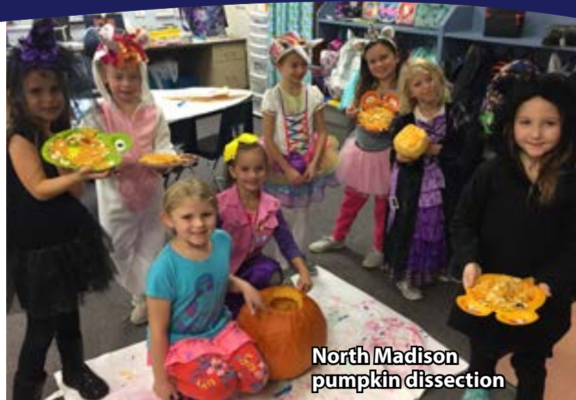
North Madison pumpkin dissection

At North Madison, first graders dissected pumpkins, learned the pumpkin life cycle, and counted pumpkin seeds.