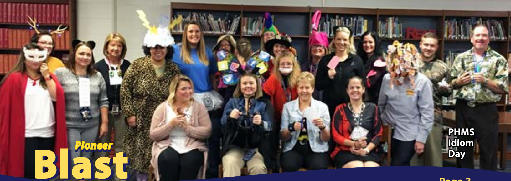
PHMS Idiom Day