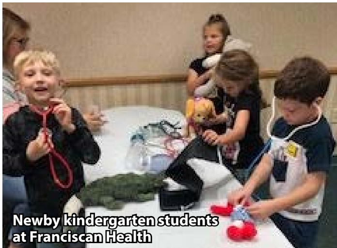
Newby kindergarten students at Franciscan Health

Waverly 4th Graders visit the Academy Building to try Pioneer School Days