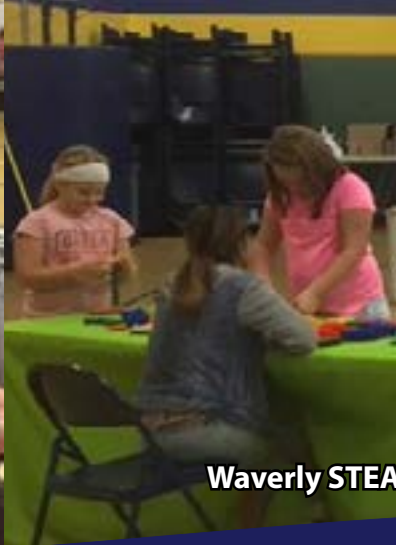
Waverly STEAM Museum Day