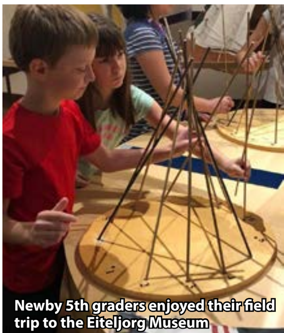
Newby 5th graders enjoyed their field trip to the Eiteljorg Museum