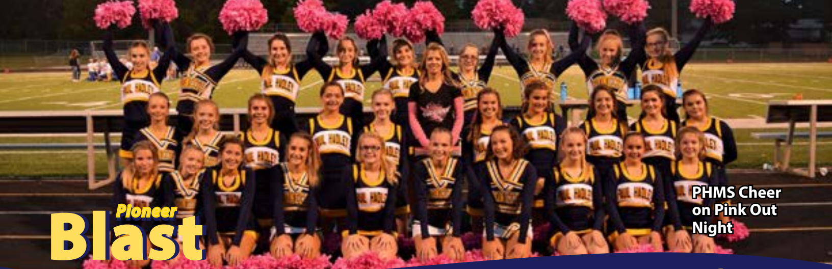
PHMS Cheer on Pink Out Night