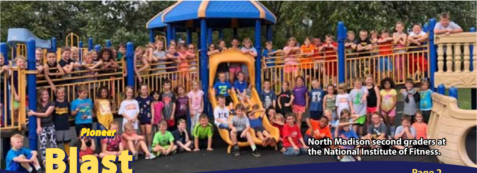
North Madison second graders at the National Institute of Fitness.