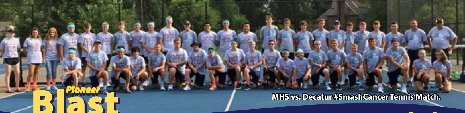
MHS vs. Decatur #SmashCancer Tennis Match.