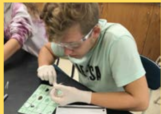
MHS Biomedical Sciences students are well on their way to becoming forensic scientists. They are investigating several pieces of evidence in the mysterious death of the fictional Anna Garcia, including fingerprints, hair, and blood.