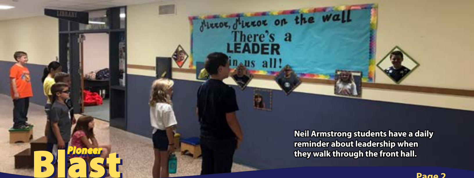
Neil Armstrong students have a daily reminder about leadership when they walk through the front hall.