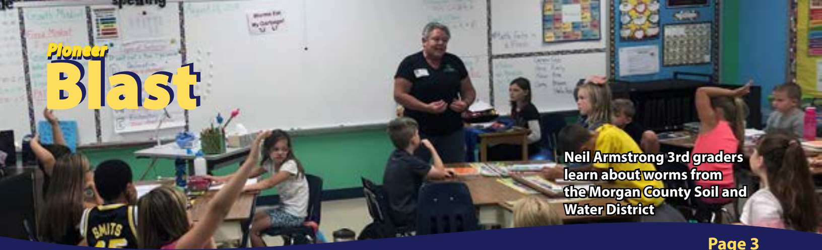
Neil Armstrong 3rd graders learn about worms from the Morgan County Soil and Water District