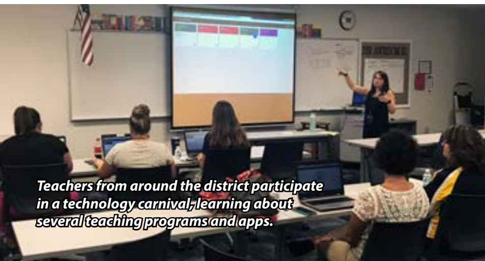
Teachers from around the district participate in a technology carnival, learning about several teaching programs and apps.

Students and staff throughout Mooresville Schools are already deep into learning this school year.