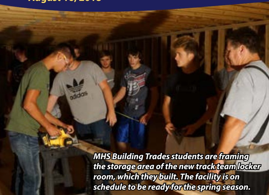
MHS Building Trades students are framing the storage area of the new track team locker room, which they built. The facility is on schedule to be ready for the spring season.