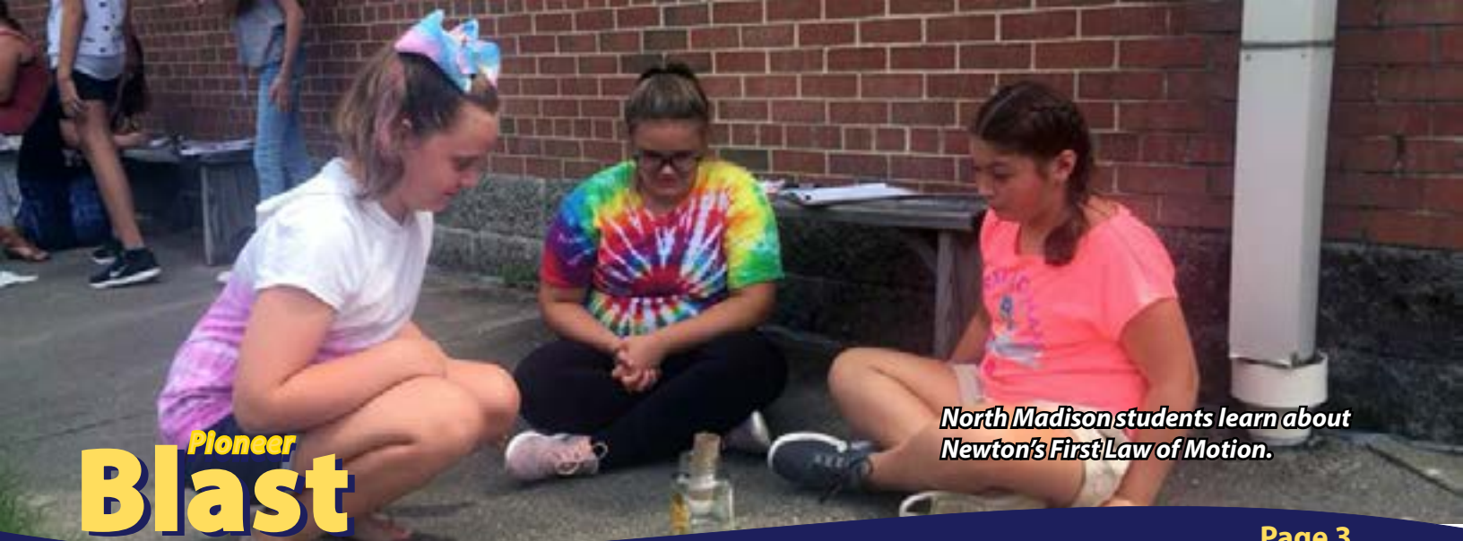
North Madison students learn about Newton's First Law of Motion.