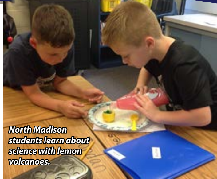
North Madison students learn about science with lemon volcanoes.