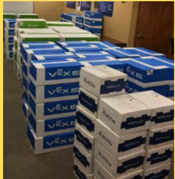
Project Lead the Way Materials, including iPads and robotics kits, for elementary schools have arrived at the Education Center.

The district wide implementation of Project Lead the Way (PLTW) is underway at all of the Mooresville Elementary Schools. All elementary school students will take part in at least two different PLTW modules this year. Learn more about the Project Lead the Way Program here .