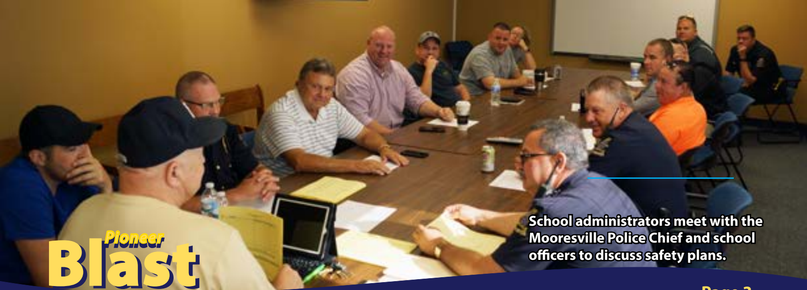
School administrators meet with the Mooresville Police Chief and school officers to discuss safety plans.