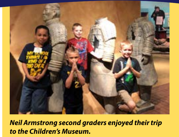
Neil Armstrong second graders enjoyed their trip to the Children's Museum.

The online ISTEP+ portal opens beginning June 11. Learn more on our website.