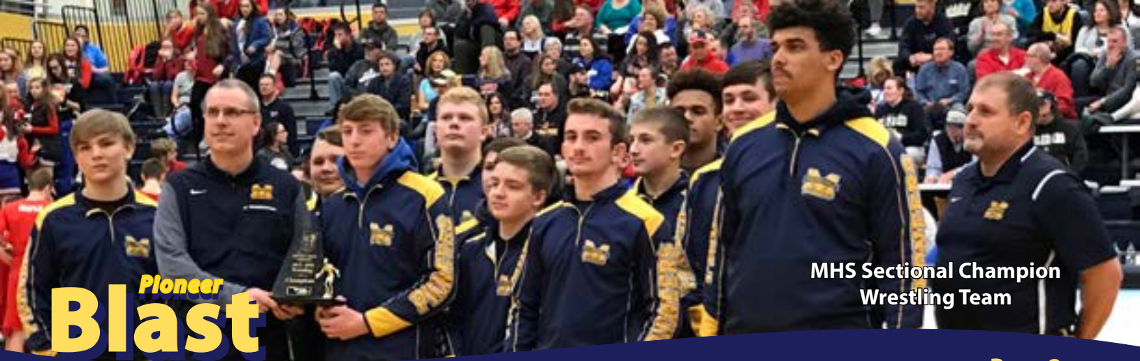
MHS Sectional Champion Wrestling Team