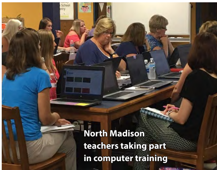
North Madison teachers taking part in computer training

The learning didn't stop for these Pioneers!