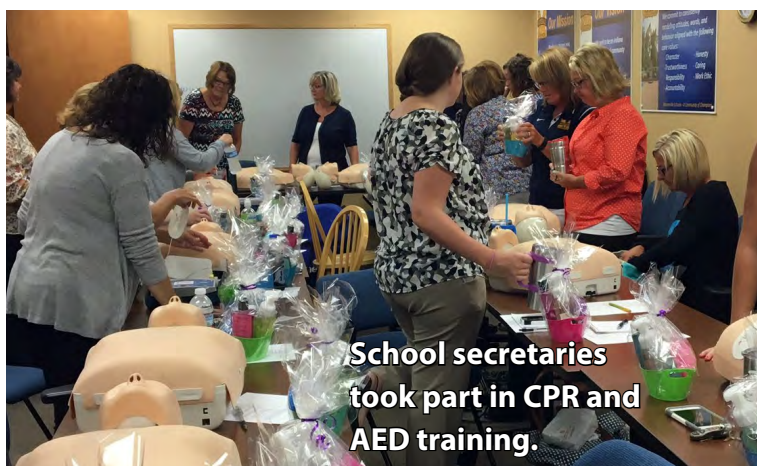
School secretaries took part in CPR and AED training.