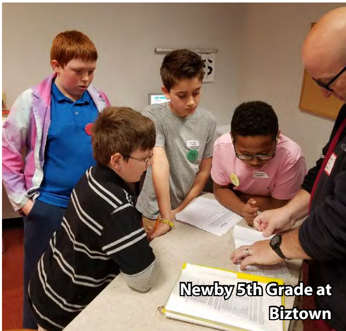
Newby 5th Grade at Biztown