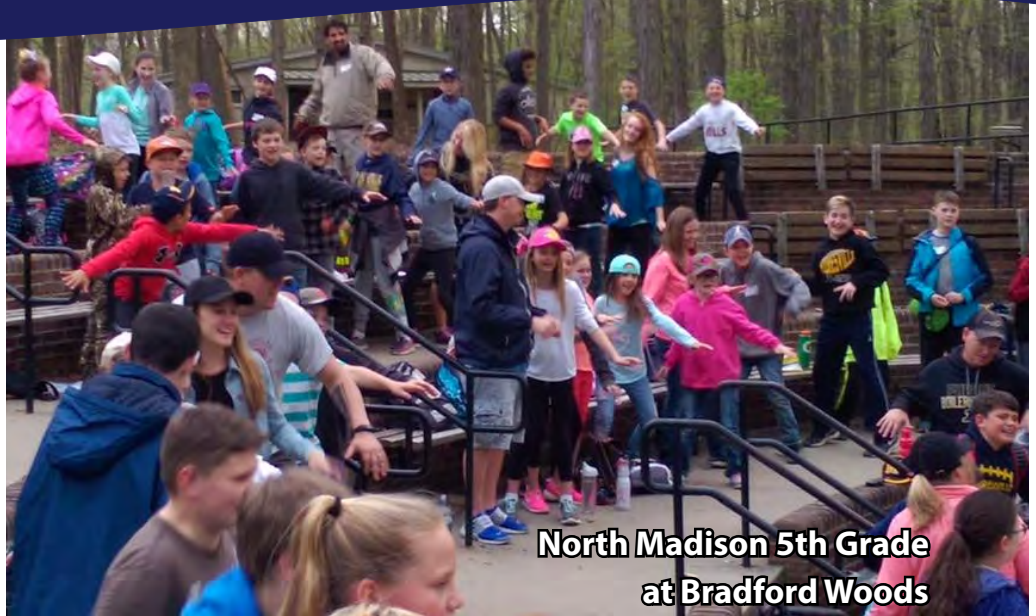
North Madison 5th Grade at Bradford Woods

Many of our students are getting a chance to explore the world around them with field trips this spring, including these students!