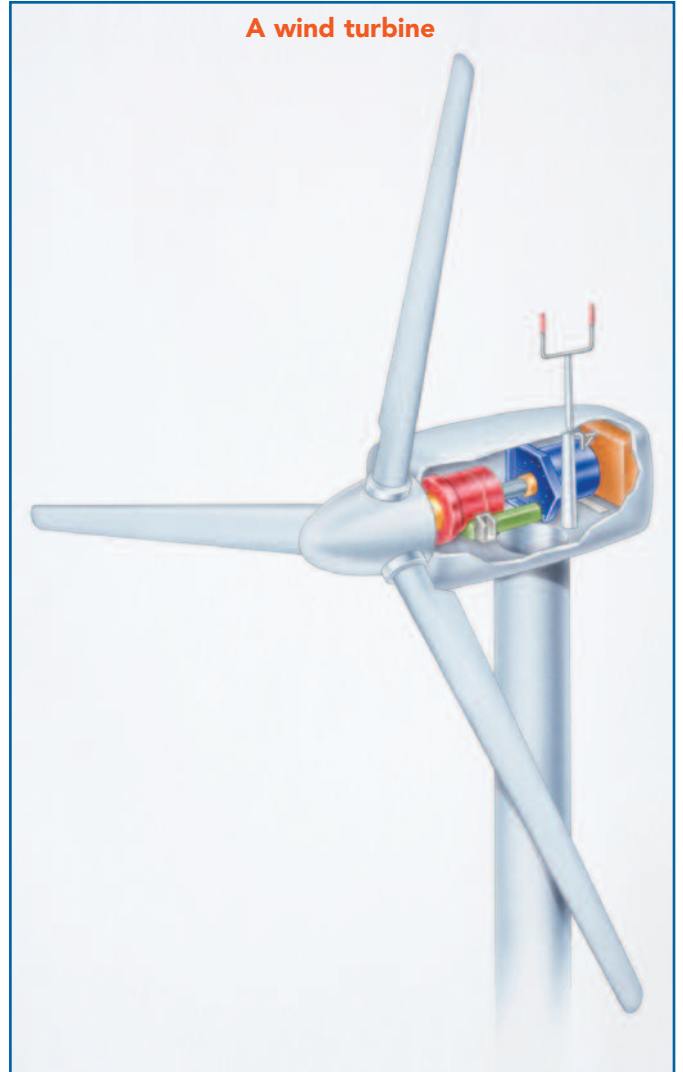
A wind turbine