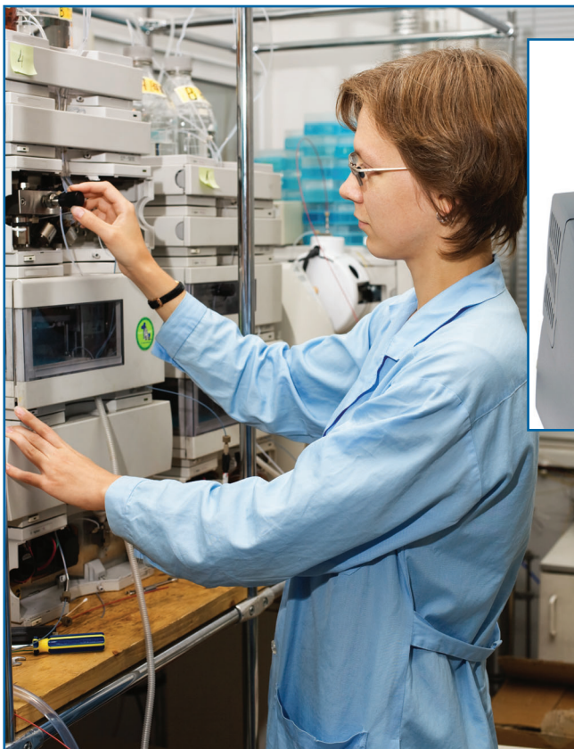
Chromatograph: performs chemical analyses.