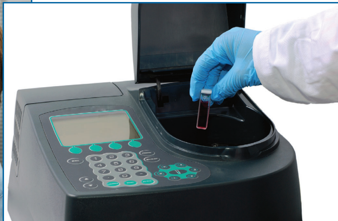
Spectrophotometer: measures the degree of absorption for a given wavelength.