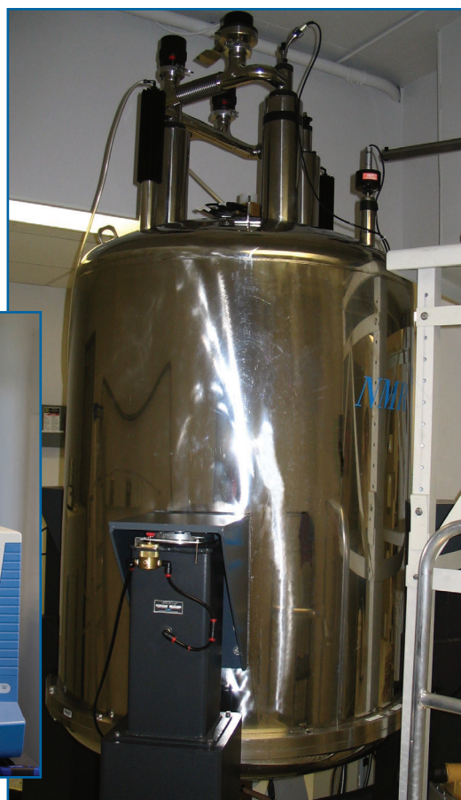
High-resolution NMR spectroscopy: studies highly complex molecules.